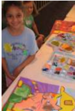
Art Camp 2010