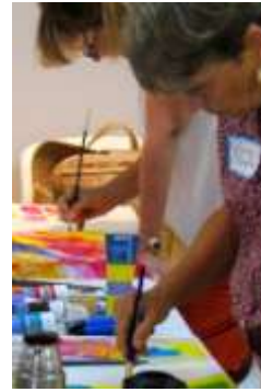
Acrylic Workshop 2010

Thank you to everyone who filled out our marketing survey! The goal of the survey is to go first and foremost to our valued members, to get your input on who we are, so we can create a marketing strategy that best reflects our mission and goals to the community at large. The results confirmed The Art Center is a community focused organization, " Where Art Lives " to promote the integration, education and appreciation of the arts, within Corpus Christi and across the Coastal Bend. What separates us from similar organizations is reflected in the meaning behind our name. We are a " Center ," with a central location and gathering place for art classes, exhibits, workshops and events. We have local appeal and showcase local and regional artists. We are all inclusive and accessible , with free admission and programs targeted to all ages, skill levels, and segments of the community. This valuable insight will be utilized by staff and graphic designers to create a cohesive Art Center brand that will be reflected in marketing materials starting with a new website. Stay tuned as these materials are released! If you have any questions or comments please e-mail Jessica@artcentercc.org .