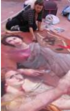
Festival of the Arts 2009

We Asked, You answered! Marketing Survey Results Confirm The Art Center is "Where Art Lives" in the Coastal bend